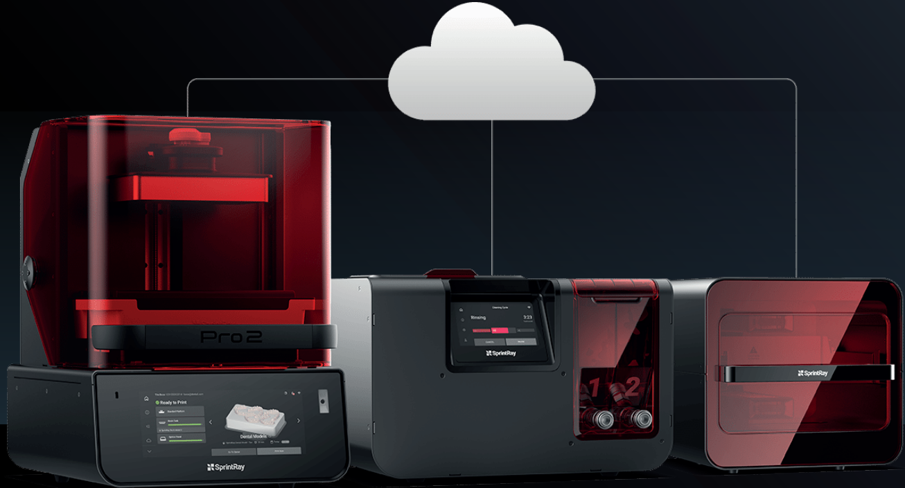
PRO 2 PRINTER

When you start a print job, you're activating a full production ecosystem that monitors progress and keeps track of finishing instructions. With SprintRay Cloud, your devices automatically transfer job information from start to finish. That's frictionless.